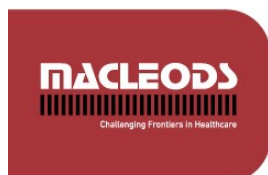
Macleods Pharmaceuticals SA (Pty) Ltd.